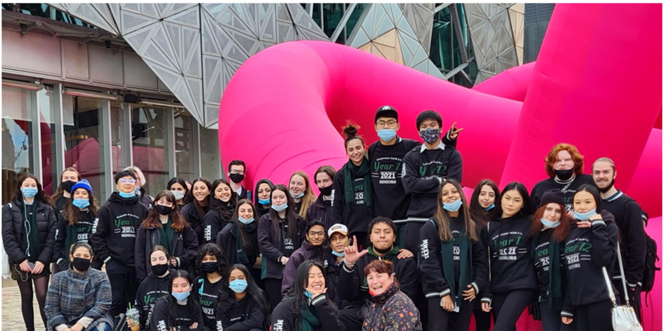
Thursday 5 th August 2021, Yr 12 Studio Arts - Art and Photography Students enjoyed a day in the city for their Unit 4 Gallery Excursion, in between lock downs. Educational and loads of fun!! Teachers – Ms Porter and Ms Carvalho in front of NGV sculpture